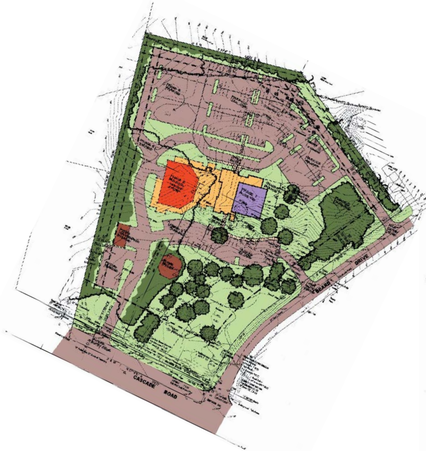
master plan site concept