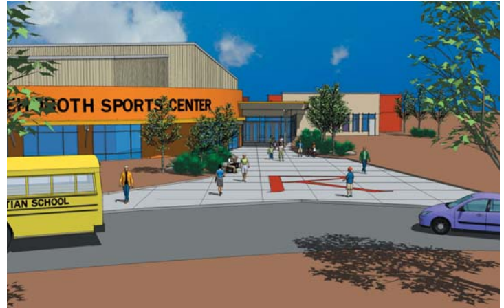
athletic center entry 3-d concept