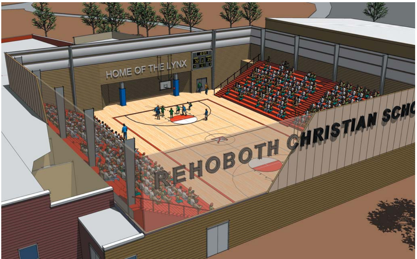
athletic center 3-d concept