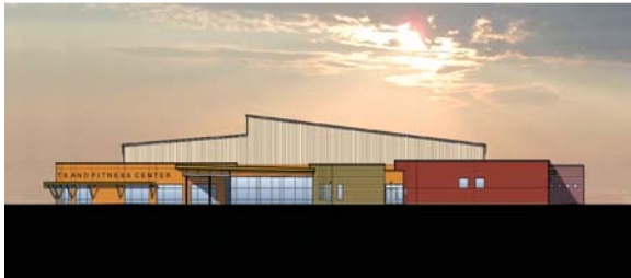
athletic center exterior elevation