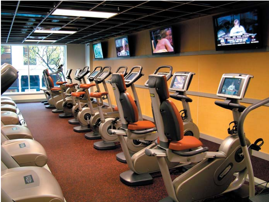
new cardio theatre