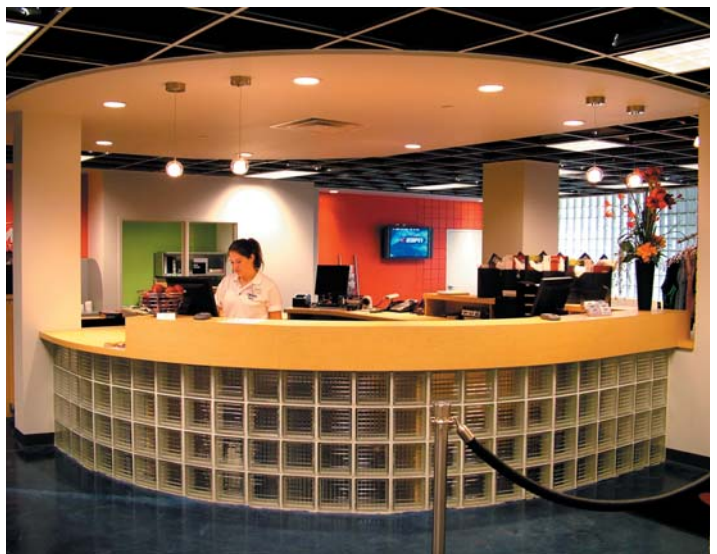
new control desk