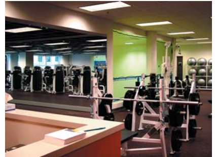
view to racquetball and squash courts