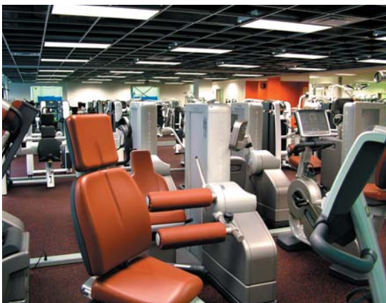
strength and conditioning