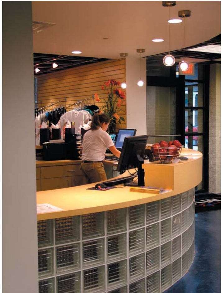
new control desk