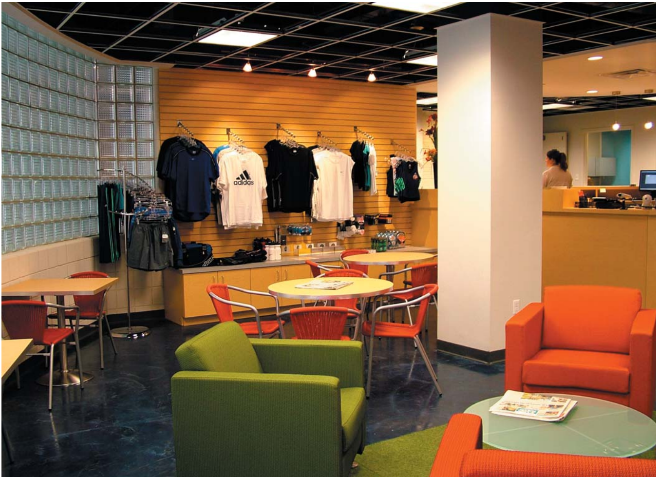
new member lounge