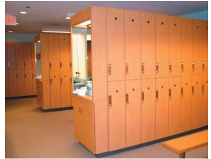
updated locker room