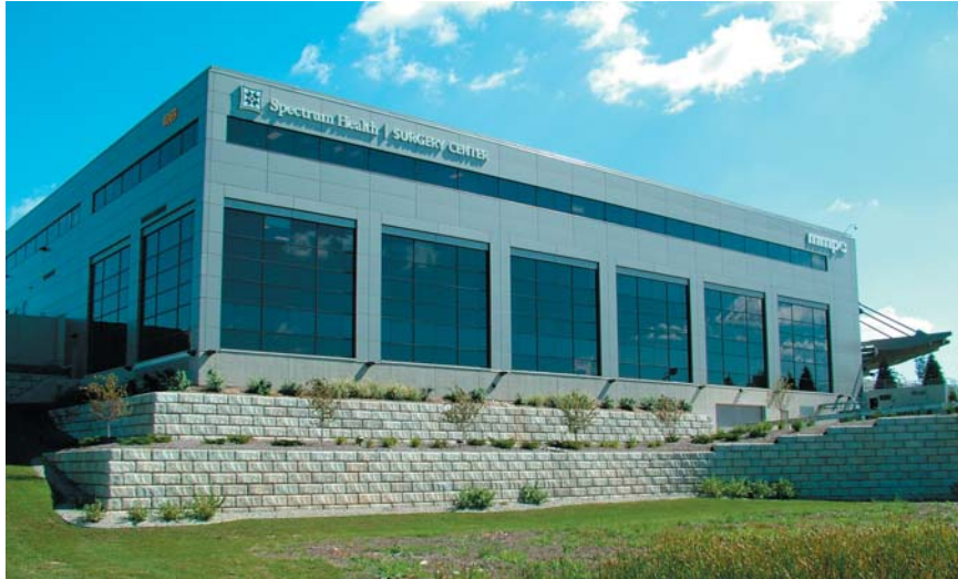
west face of building