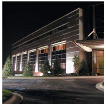
west face of building