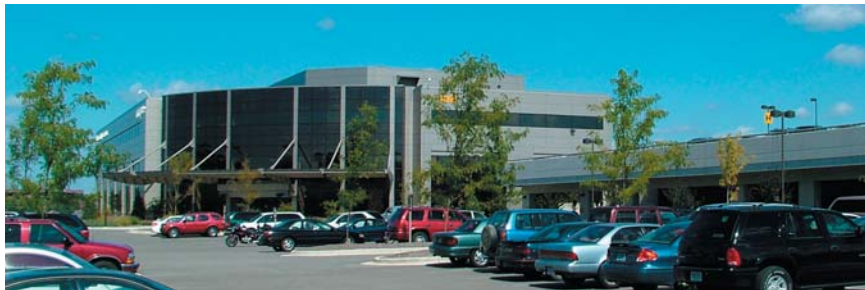
southwest elevation with parking structure