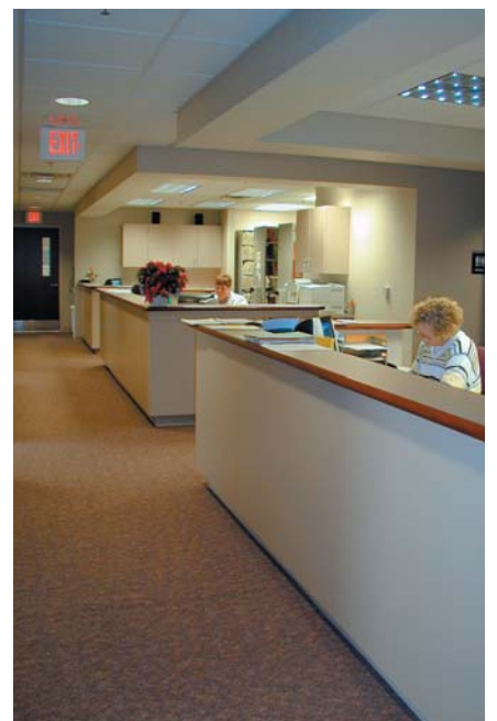
another view of nurses' station