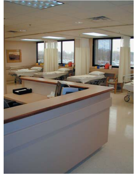
view of recovery area from nurses' station