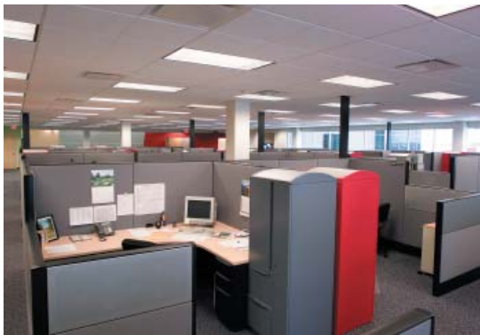
open office area