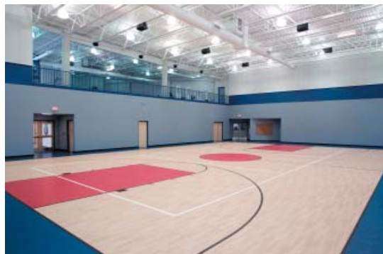
Ridgeview Athletic Center