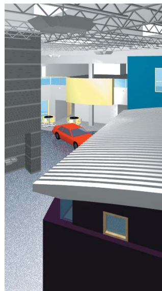
town square (computer rendering and actual)