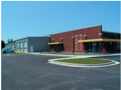
entrance / receiving