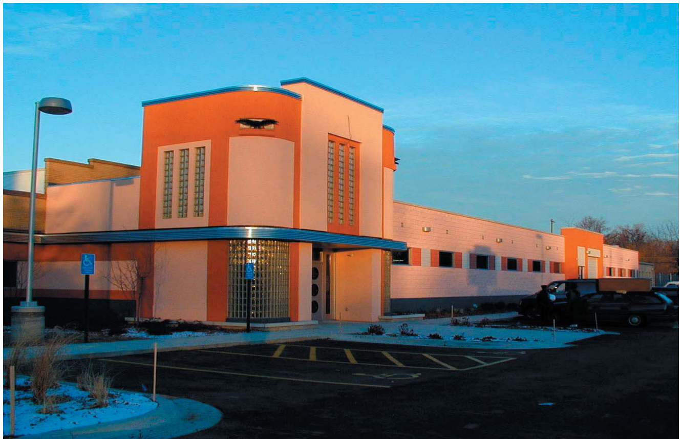
after: new main entry and south addition