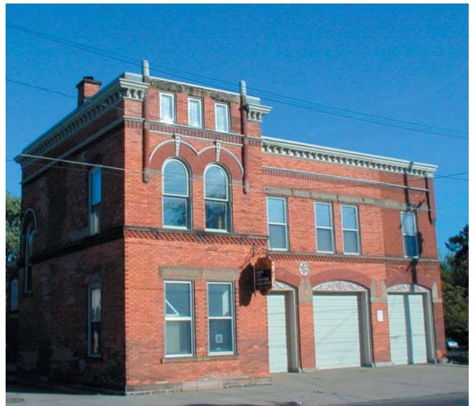
existing fire station at 816 Madison