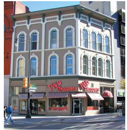
southwest elevation - before