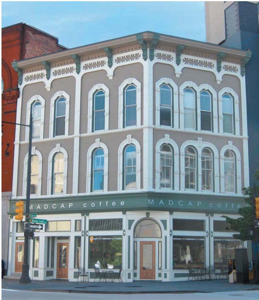
southwest elevation - after