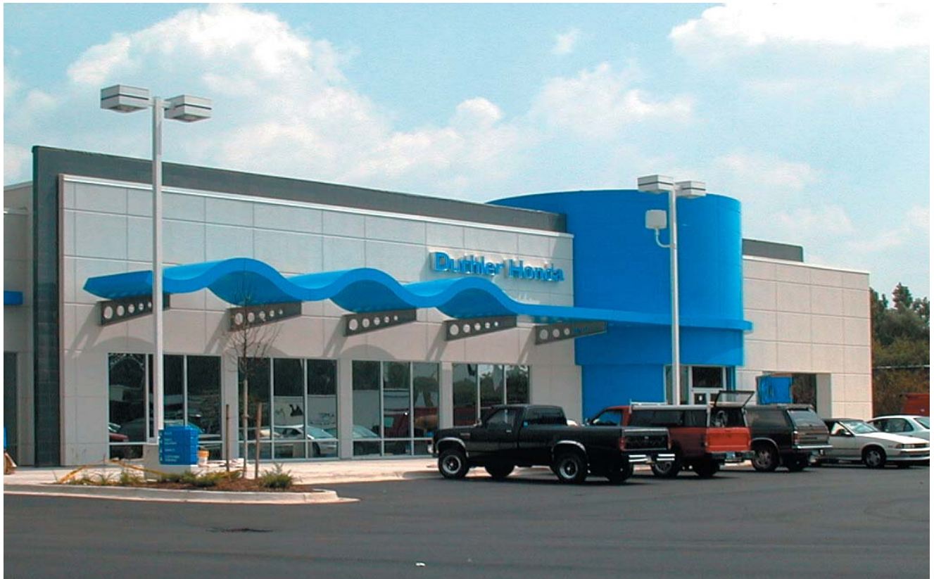
main entry with Honda wave and cylinder