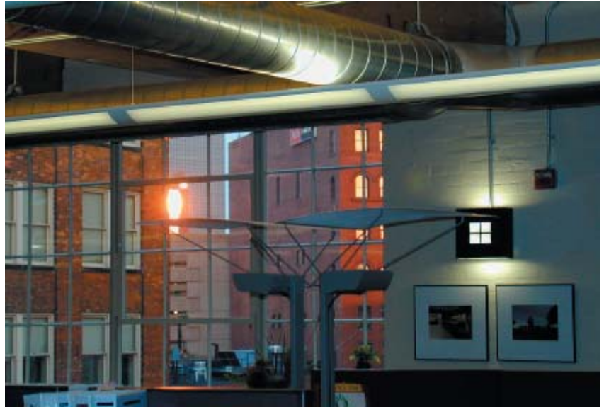
view from office